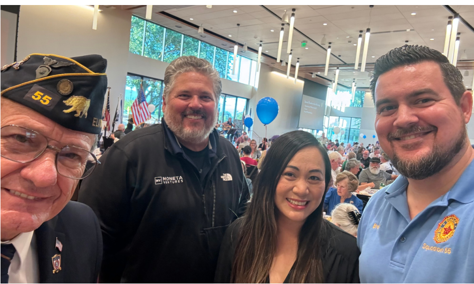
Joined the American Legion Post 55 for their Inaugural Dinner! Such a great time celebrating our veterans' service and sacrifice. Had an incredible night with great food, good company, and continuing to honor those who've made all of this possible.