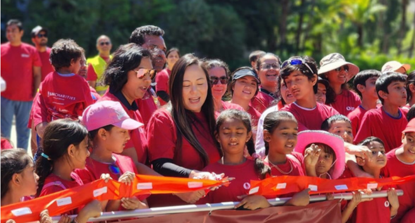
Had the honor to begin the launch for The Joy of Others 5k Walk/Run hosted by BAPS Charity! BAPS Charity continues to provide the opportunity for those wishing to serve locally and globally to create a better community, nation, and world.