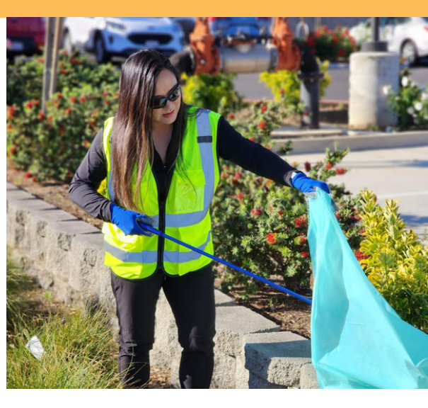
Spent a weekend to celebrate Earth Day by rolling up our sleeves and cleaning up our community! Huge thanks to Tahoe Park Neighborhood Association and Stockton Boulevard Partnership for your unwavering dedication to this tradition to make our neighborhoods cleaner and greener every year!