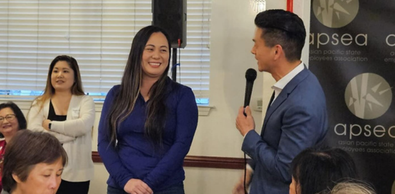
The Asian Pacific State Employees Association (APSEA) was founded in 1999, I was honored to attend and help promote education and professional growth within the API Community. Congratulations to all the recipients for the 24th Annual Scholarship Gala!