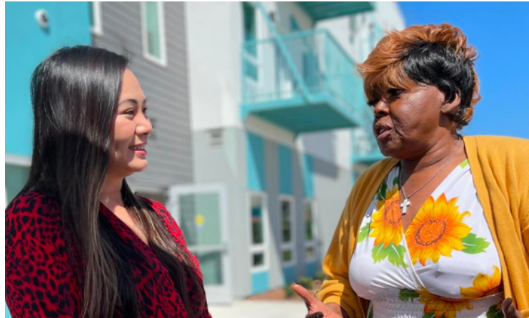
Attended the grand opening for the 100% leased Mutual Housing on the Boulevard in District 10! This mutual housing was able to house 127 families including those who were unhoused previously. Let's continue to build stronger communities for future generations!